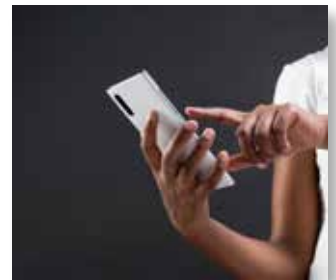
Telephonic emergency assist helpline