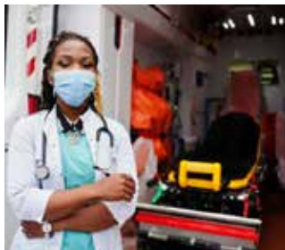
24-hour Emergency Medical Assistance