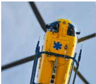
Road & Air Transport