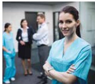
Advice from a qualified team of Nurses